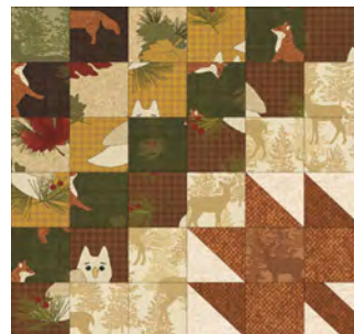
BLOCK 1 make (8)

Cut batting and backing 3" larger than top on all sides. Layer backing, batting and top together and baste or pin. When quilting is completed, trim excess batting and backing. Bind with P fabric.